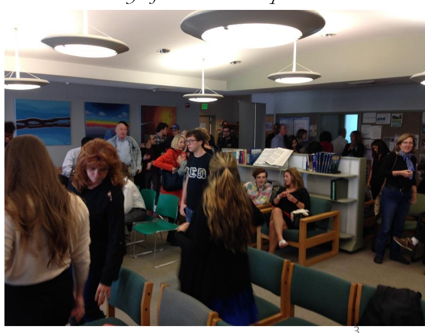
A packed house!